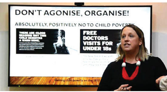
Absolutely positively no to child poverty campaigning workshop Wellington, August 2017