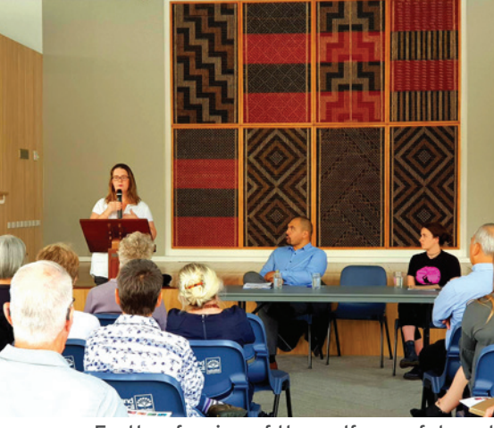
Further fraying of the welfare safety net Report launch, Auckland - December 2017